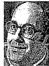
Henri Nouwen, a writer and speaker, is a member of the Daybreak community in Toronto.